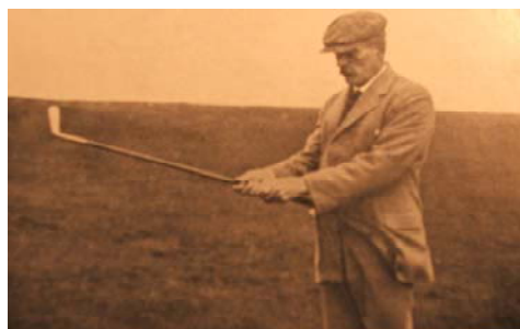
Willie Park taken from The Art of Putting

This book is about Park's recommended putting style. Park always hit the top half of the ball, thus imparting topspin. He also advocated focusing only on the ball and not the hole, which was a novel idea at the time. At the time, putting was done almost entirely with the wrists.