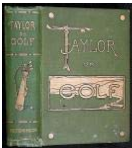
First British Edition

Taylor on Golf: Impressions, Comments and Hints was published in 1902 by Hutchinson, London. The American edition was published by Appleton in 1903. The book was published with several different binding styles, depending upon the edition. The first British edition has the title in gilt with a design on the front (seen on the left), the first American has six golf clubs on the front (seen in the middle), and later editions have a golf bag and clubs on the cover (seen on the right).