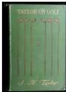
First U.S. Edition